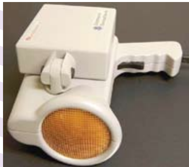
LEXID lobster eye imaging device Science & Technology Directorate, Department of Homeland Security

“The evolution of superposition eyes from the apposition eyes found in primitive crustaceans poses a particular problem. The apposition eye produces multiple inverted images whereas in the superposition eye a single erect image is present. To make this transition without going via non-functioning intermediates requires a continuing correction of the focusing properties of the dioptric apparatus so that light leaving the